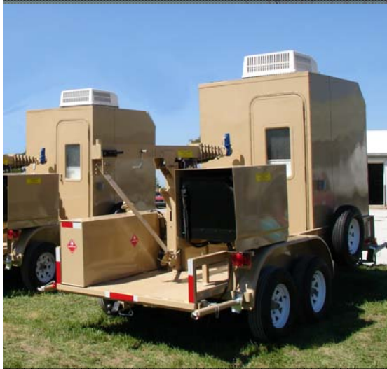
CLIENT: RAYTHEON – U.S. Army Live Training Program Custom Trailers with many shelter and power options available